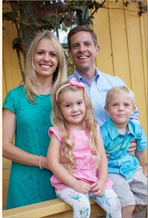
Our family today.