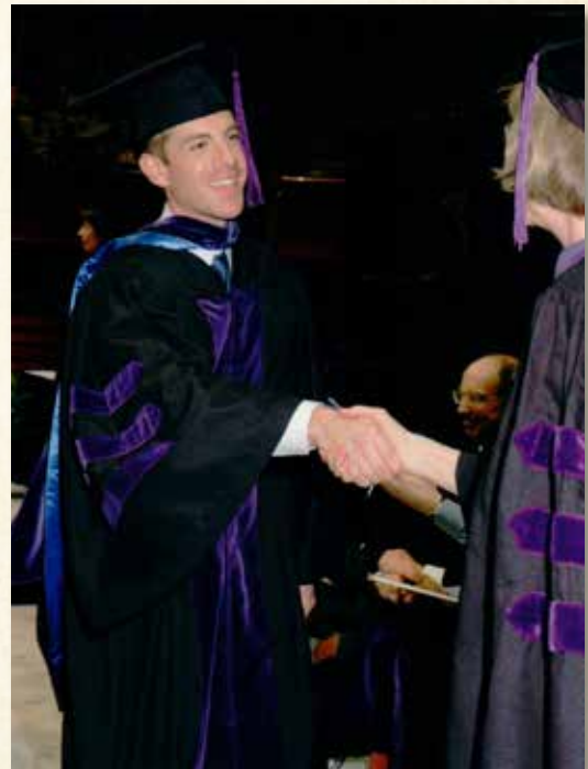
Graduating from Duke Law School.

I attended Stanford University where I was elected Student Body President. After earning my law degree from Duke University, I moved back to California, ready to change the world. Soon I became the Executive Director of the Democratic Party of Orange County, where I developed my lifelong commitment to grassroots activism and social change.