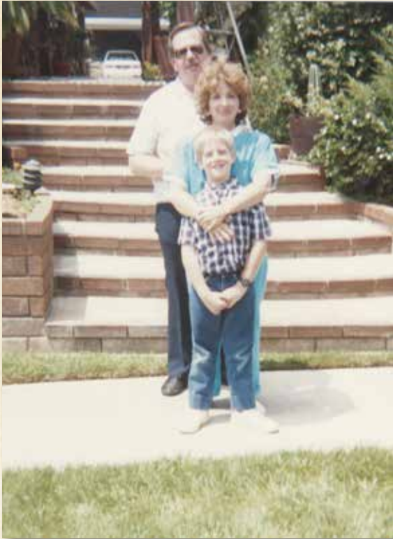
With my parents, growing up in South Orange County.